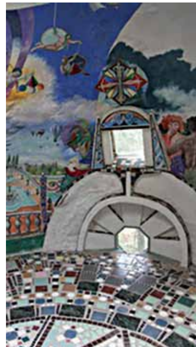
Murals depicting the intersection of the arts with the history of science and technology related to space travel cover the interior walls of the spaceship sculpture.