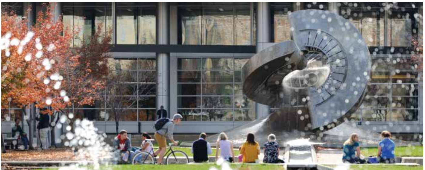
The engineering campus is abuzz with activity on a sunny day.