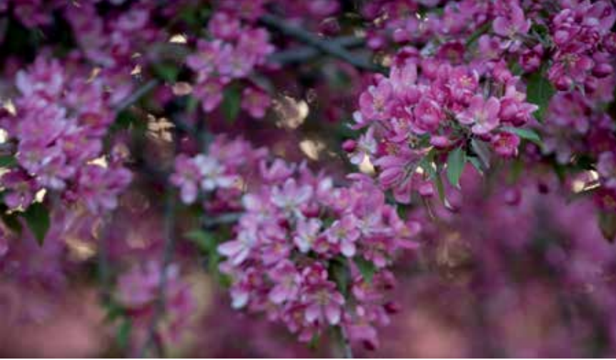
The UW Arboretum is home to thousands of flowering plants and trees.