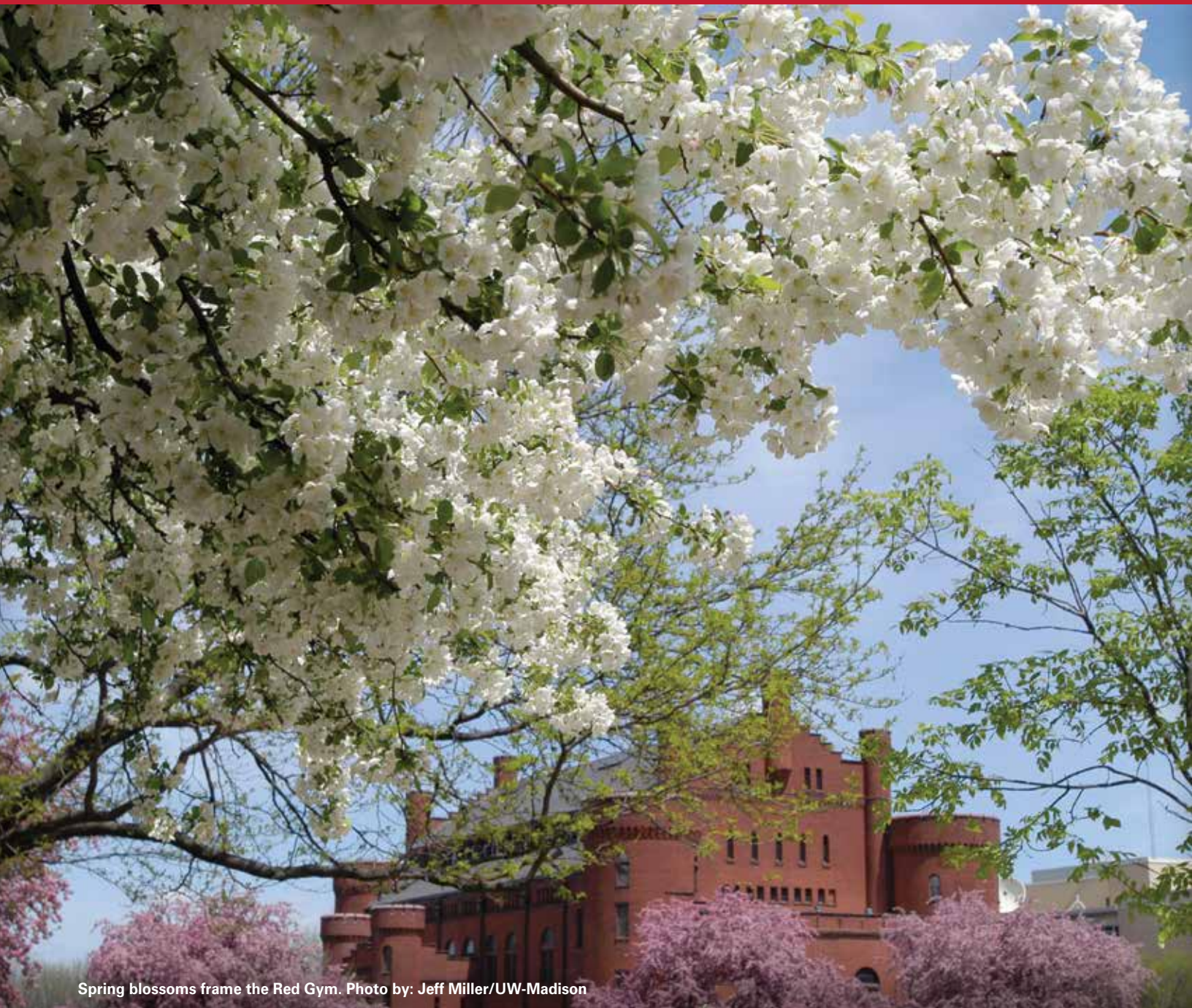
Spring blossoms frame the Red Gym.