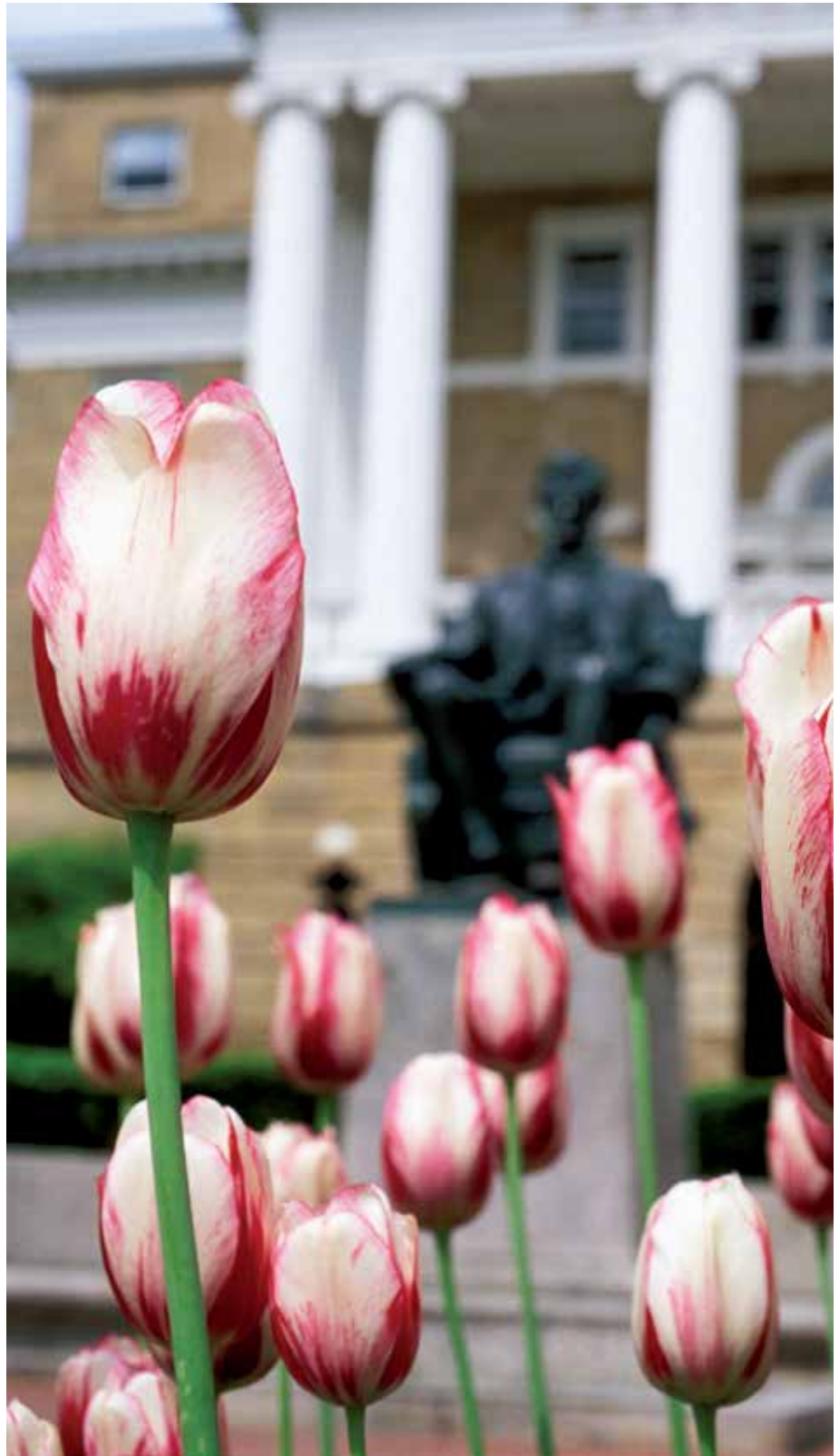
Spring bursts onto Bascom Hill.

They encouraged other alumni to support the university, concluding: “The University of Wisconsin-Madison continues to be a world-class educational institution in teaching, research, and service to the state, nation, and beyond.”